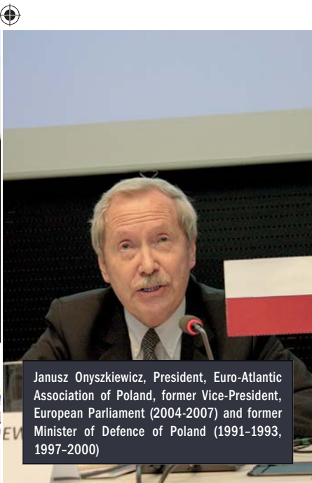
Janusz Onyszkiewicz, President, Euro-Atlantic Association of Poland, former Vice-President, European Parliament (2004-2007) and former Minister of Defence of Poland (1991-1993, 1997-2000)