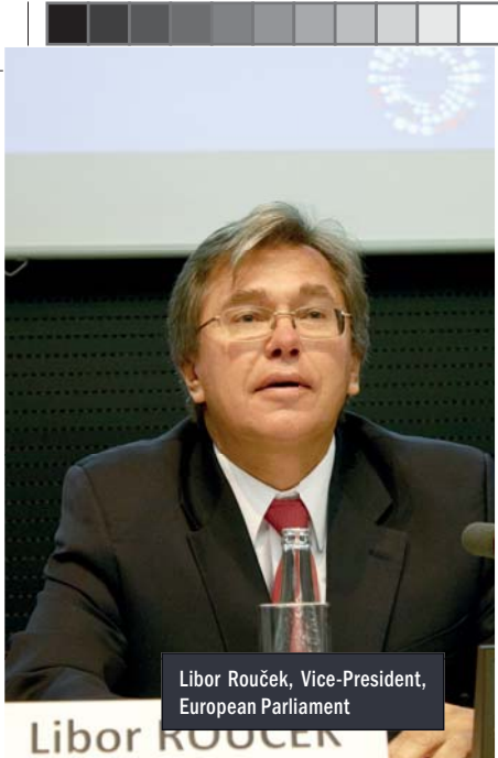
Libor Rouček, Vice-President, European Parliament