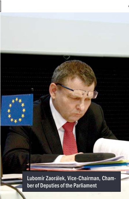
Lubomír Zaorálek, Vice-Chairman, Chamber of Deputies of the Parliament